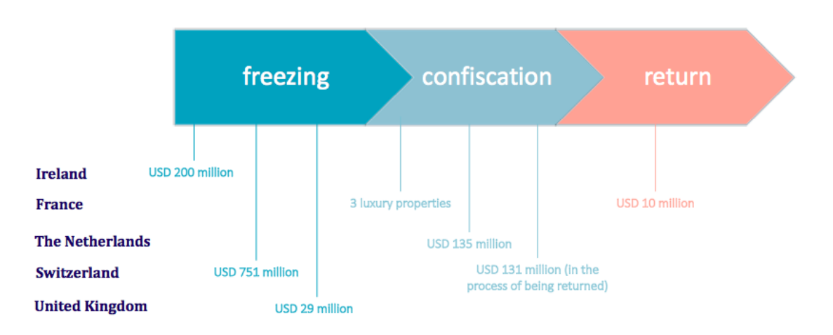
State-of-play of asset recovery proceedings in relevant jurisdictions

The Swiss restitution of assets is an important step in evolving global asset return practices which may set a precedent for future restitutions by other countries involved in this case. It is believed that the proceeds of Karimova's dealings were stashed away in banks, offshore companies, luxury goods and property around the world, including at least <u>9 EU countries</u> (Belgium, France, Germany, Ireland, Latvia, Luxembourg, Malta, the Netherlands, Spain). The graph below shows the progress of asset recovery proceedings in several jurisdictions.