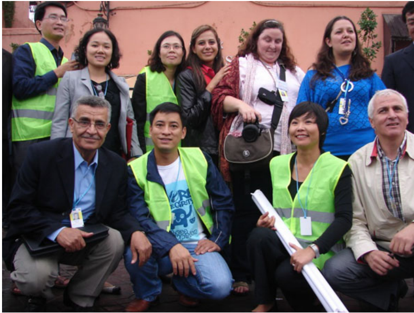
Towards Transparency and others

TT's mission is to contribute to national efforts in promoting transparency, accountability and integrity towards a corruption-free society. Read More »