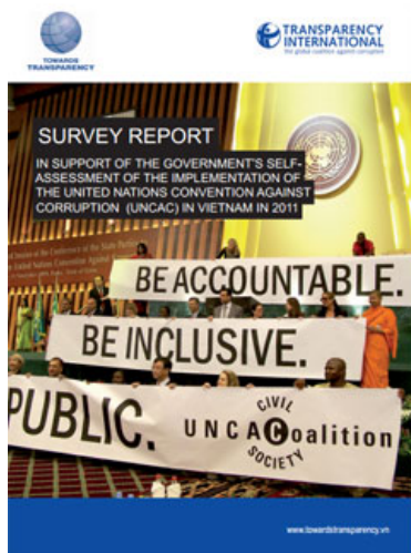
TT's 2011 Survey Report